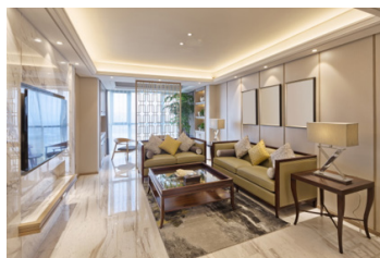
MP General Lighting