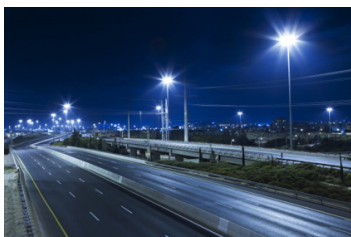
HP General Lighting